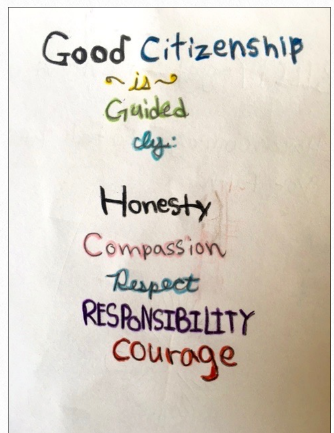
Actual Student Work